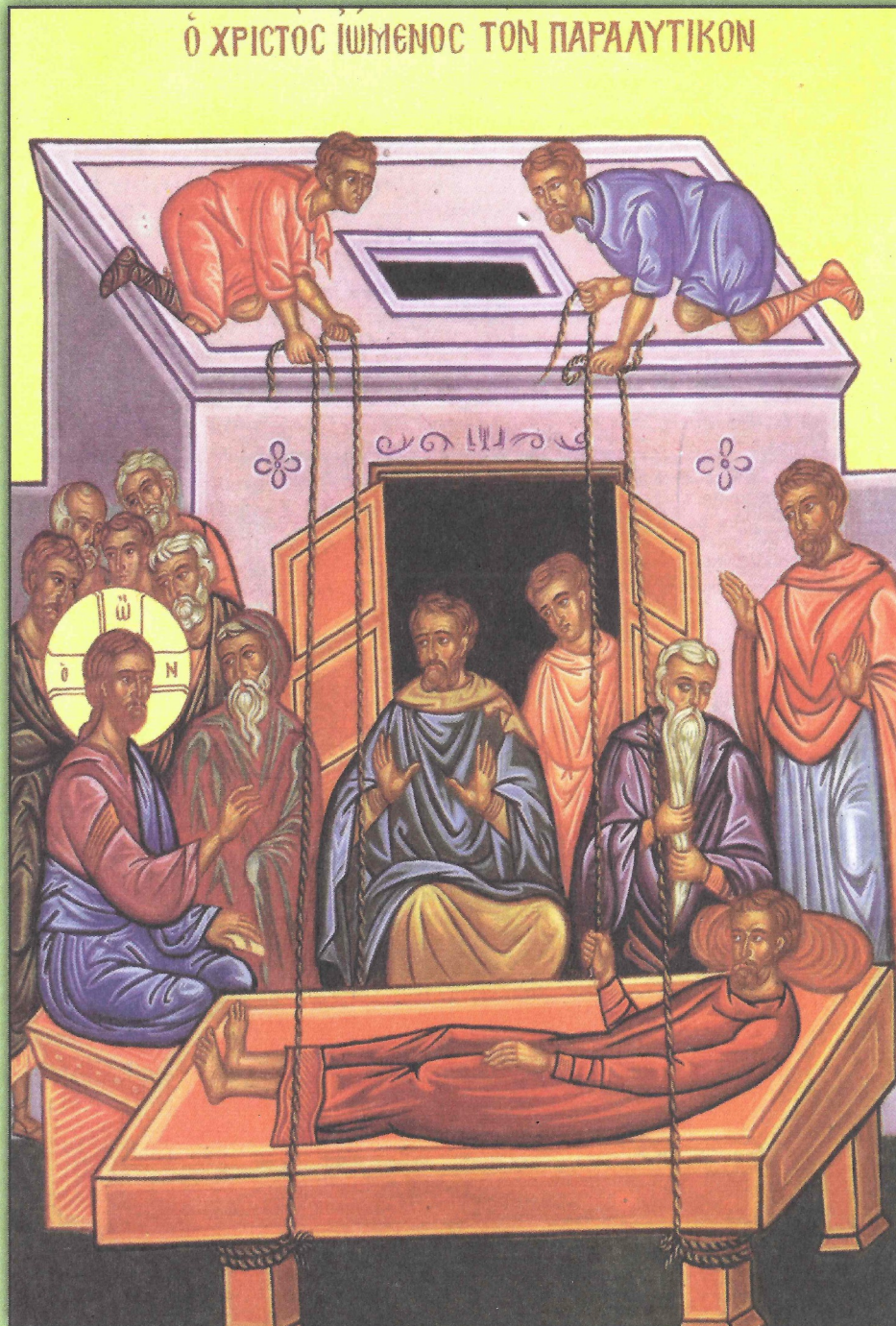
Icon of Healing the Paralytic